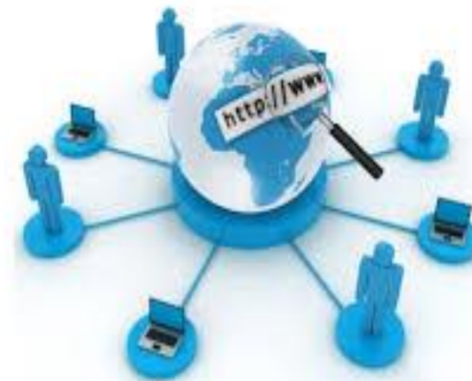
InterNet and World Wide Web

The World Wide Web ( WWW or simply the Web ) is an information system that enables content sharing over the Internet .